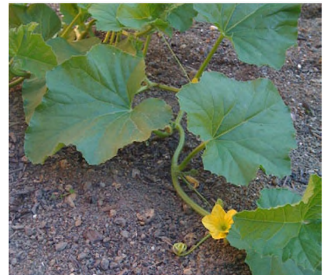
Top and bottom: Vegetables in the TBE Garden.